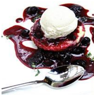
Black Raspberry Vanilla – A mouthwatering goodness of black raspberries and creamy vanilla.