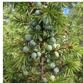
Juniper Breeze – An ozony blend of floral, green, and fruity notes with a slight musk undertone.