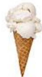
Vanilla - Absolutely fabulous sweet, sugary, buttery vanilla!