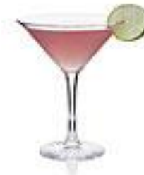
Pink Lime - Top notes of lime, dewfruit, peach, orange, apple, and mandarin blend with middle notes of lily, berries, jasmine, and lavender into a sandalwood, raspberry vanilla, musk, coconut base.