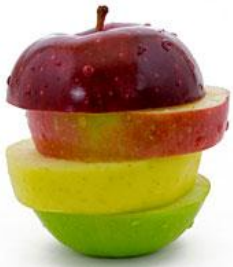
Apple Slices – Smells like you just cut into a fresh apple!