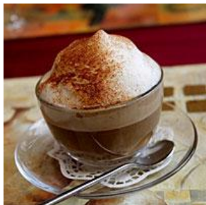
Cappuccino Mocha – Smells like a fresh hot cup of café mocha.