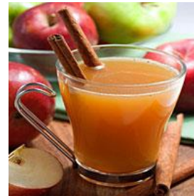
Mulled Cider – A spicy bouquet of apple, clove, orange and cinnamon topnotes with a sweet musky background.