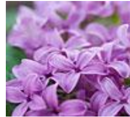
Lilac - Wild flower picked off the tree.