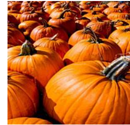
Pumpkin Pickin' – A French vanilla cream pudding slightly caramelized with hints of pumpkin spices.