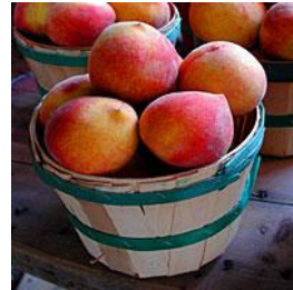
Georgia Peach – A slice of freshly cut peach that is just ripe from the tree.