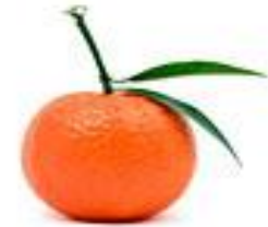
Sparkling Mandarin Tangerine A unique, effervescent accord enlivens a juicy fruit complex of lemon, mandarin and tangerine spiked with hints of fresh ginger.