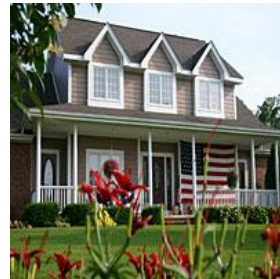
Home Sweet Home – A fragrance to draw you home with cinnamon and clove, rosemary and ylang.